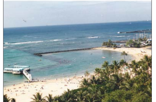
Ed and me in our favorite place, HAWAII and the view from our bedroom window.