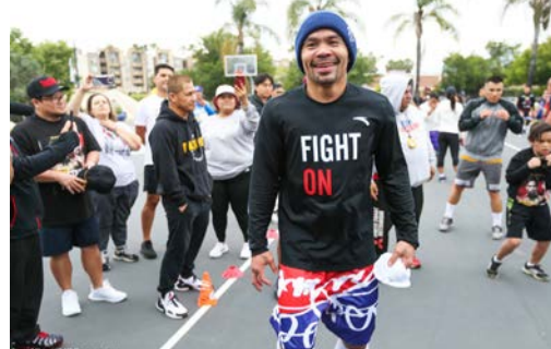
Manny Pacquiao training at Griffith Park, Los Angeles